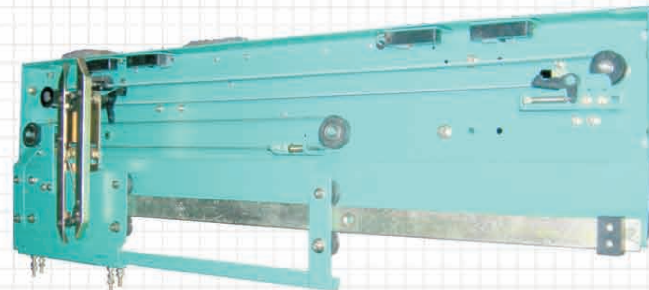
Car Door Operator